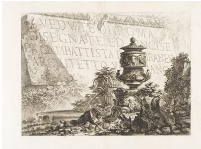
Giovanni Battista Piranesi Vedute di Roma. (Rome 1748-1769). Estimate price: € 60,000 Sold for: € 65,000