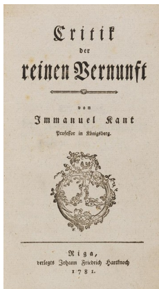
Immanuel Kant Critik der reinen Vernunft, 1781. Estimate price: € 12,000 Sold for: € 22,500