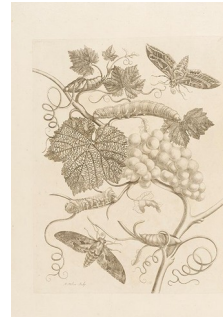
Maria Sibylla Merian De Europische Insecten. Bound in: Surinaamsche Insecten, 1730. Estimate price: € 30,000 Sold for: € 45,000