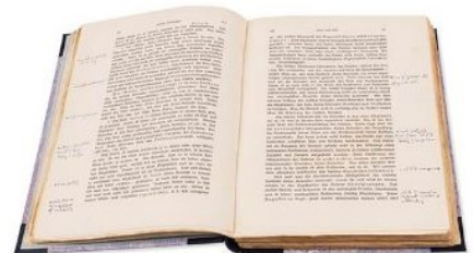
Martin Heidegger Sein und Zeit. Copy of Gilbert Ryle, 1926. Estimate price: € 2,500 Sold for: € 20,625