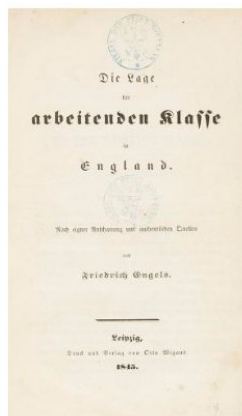
Friedrich Engels Die Lage der arbeitenden Klasse in England, 1845. Estimate price: € 5,000 Sold for: € 21,500